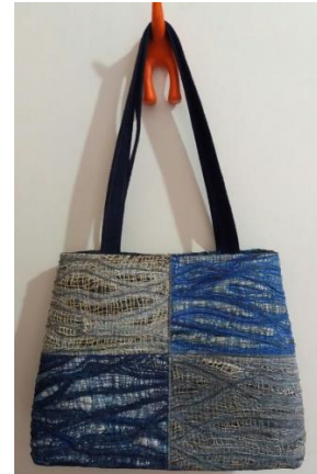
3 - using twine, cheese cloth and organza.

This class will be held on Saturday, February 9th after the general meeting.