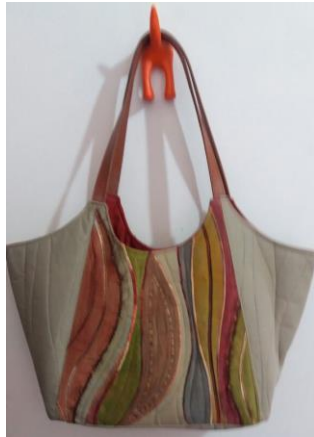
2 - using wax pastel