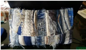
1 - using leftover scraps fabric and yarn.

In this 3 hour class, art quilt techniques will be used to create fabric “makeovers.” These techniques can be applied to bags, accessories, quilts, etc. Participants will be creating 6” samples and should plan to bring their sewing machine, a variety of threads, and general sewing supplies.